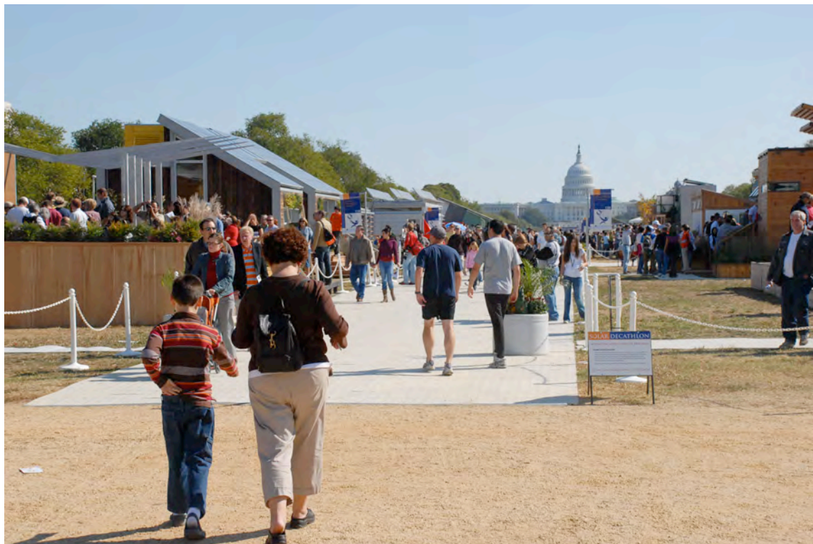
Figure 1. 2007 Solar Decathlon on National Mall in Washington, D.C.