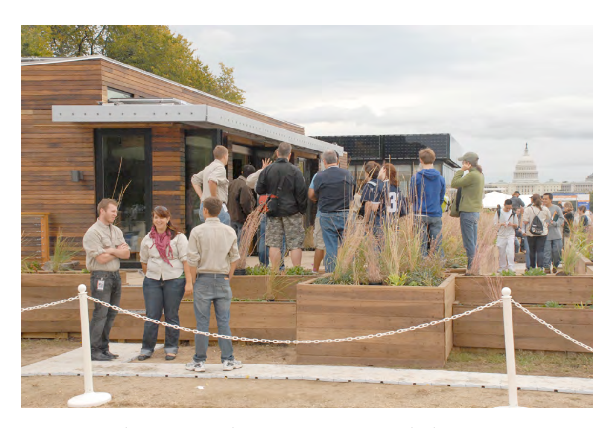
Figure 1. 2009 Solar Decathlon Competition (Washington D.C., October 2009)

The WPPSEF has strived to maintain a balance of funding to support clean energy generation, energy efficiency and conservation, and public education/ outreach. In all three of these categories, the WPPSEF seeks to support job growth whenever possible. Figure 1-3 provide an illustrative example of selected WPPSEF funded projects.