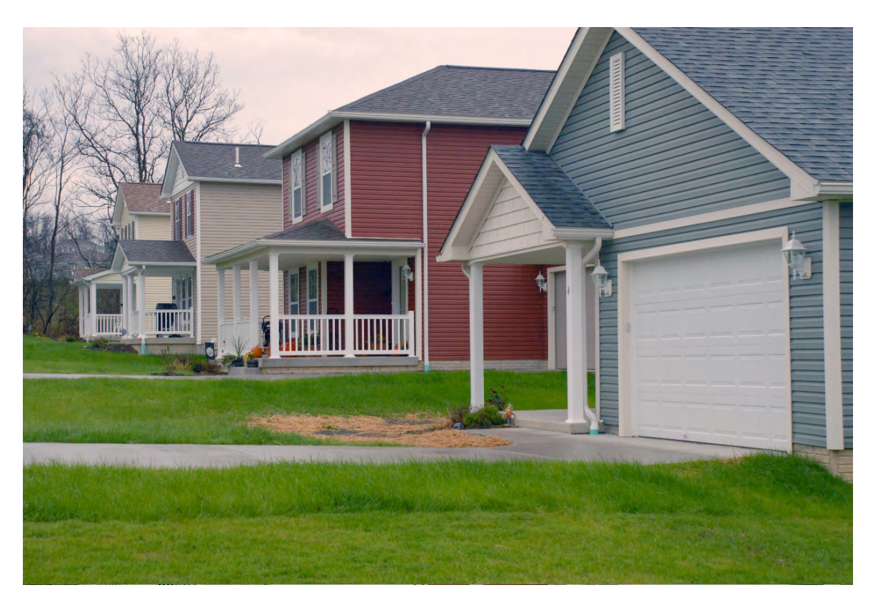
Figure 2. Uniontown Family Homes (Uniontown, PA - Thirty New Energy Star Qualified Homes Assisted by PA Home Energy Program, November 2009)