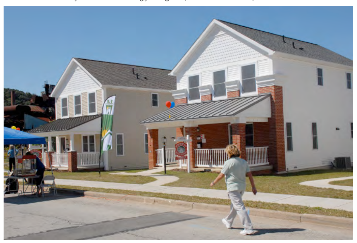
Figure 3. South Sixth Street Project, (Jeanette, PA - Nine New Energy Star Qualified Homes Assisted by PA Home Energy Program, September 2009).